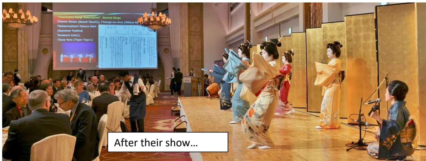
After their show...