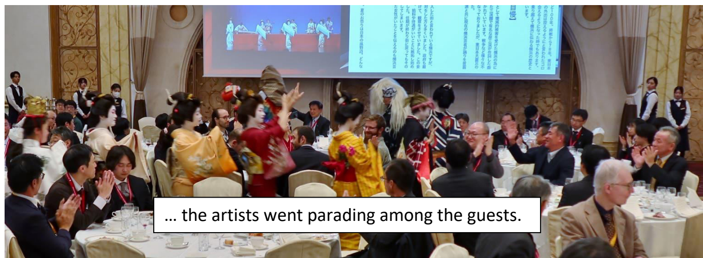
... the artists went parading among the guests.