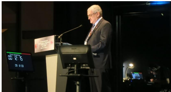
Perfect organisation: Remaining time visualized for the speaker and monitored by the technician