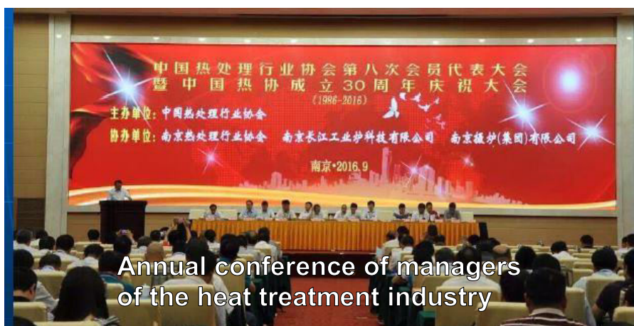
Annual conference of managers of the heat treatment industry

500 vacuum furnaces, 500 horizontal controlled atmosphere heating furnaces, 3000 ordinary heating furnaces, and 300 induction heating units.