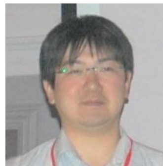
2011 Young Author Award winner:

It is hoped to be able to make the Young Author Award available again at the 20th Congress. The Award is sponsored by Linde Gas